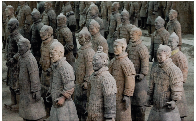
Unknown, The Terracotta Army , 200-300 BC.