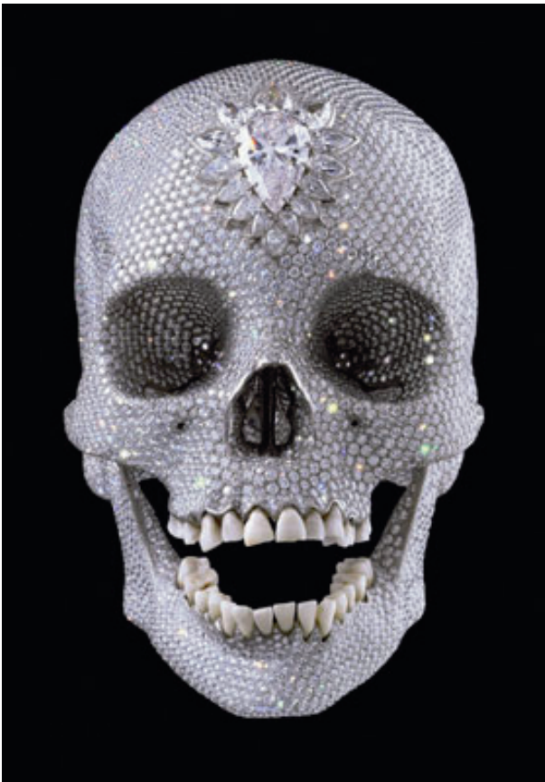
Damien Hirst, For the Love of God , 2007.