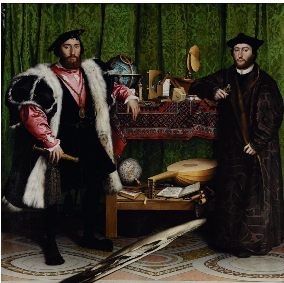
Hans Holbein, The Ambassadors , 1533. Oil on canvas, 207x209 cm, National Gallery, London