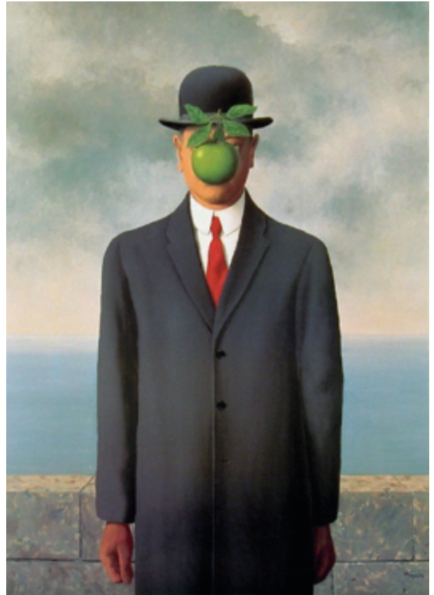
René Magritte, The Son of Man , 1964.

Go online for presentations, close ups, and more