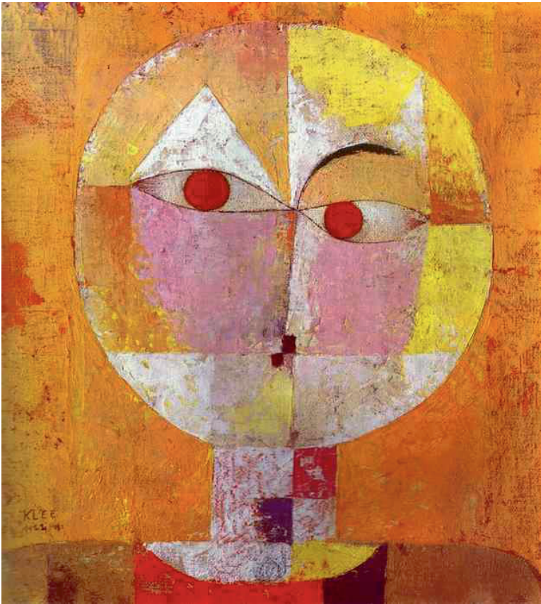
Klee, Senecio , 1922.

Dreams take things that we recognize and transform them into something unexpected. Fantasy allows us to dream while awake, with one foot in reality and one foot somewhere different .