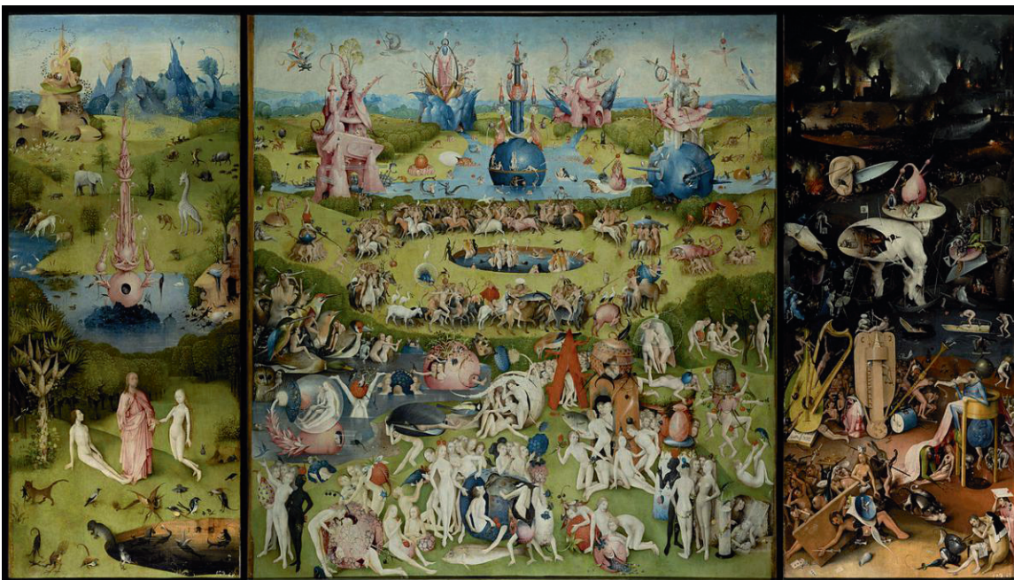
Bosch, The Garden of Earthly Delights , c 1500. Oil on wooden panels, 220 x 389 cm, Museo del Prado, Madrid