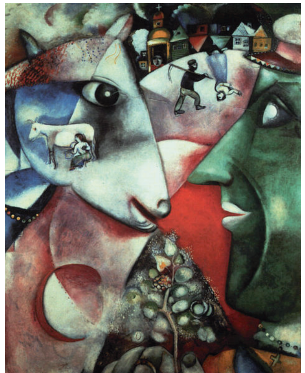
Chagall, I and the Village , 1911. Oil on canvas, 192.1 cm × 151.4 cm, Museum of Modern Art, NY