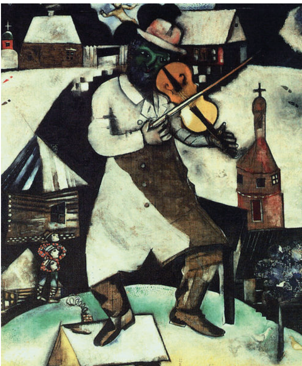
Chagall, The Fiddler , 1912.