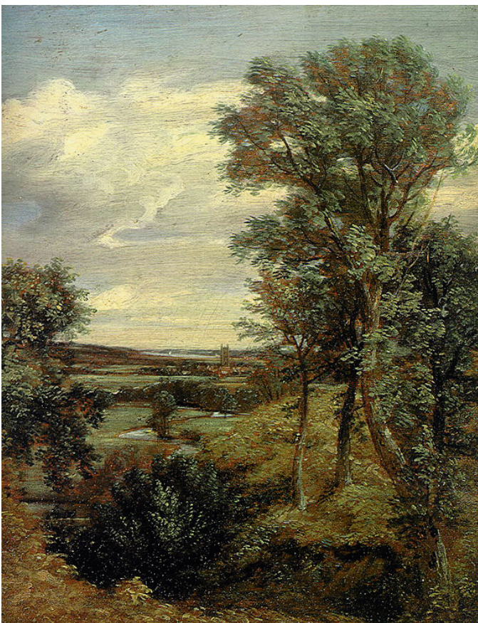
John Constable, Deadham Vale , 1802.