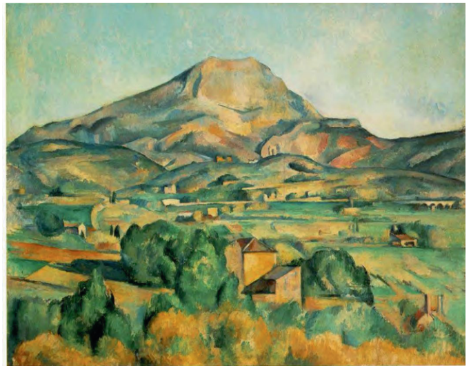
Paul Cezanne, Mont Sainte Victoire Seen from Bellevue , 1885.