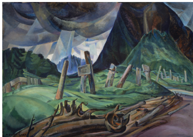
Emily Carr, Vanquished , 1930.