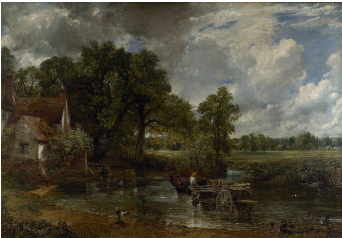
John Constable, The Hay Wain , 1821.