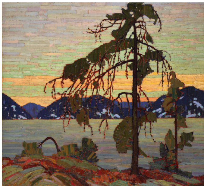
Tom Thompson, The Jack Pine , 1915-17.