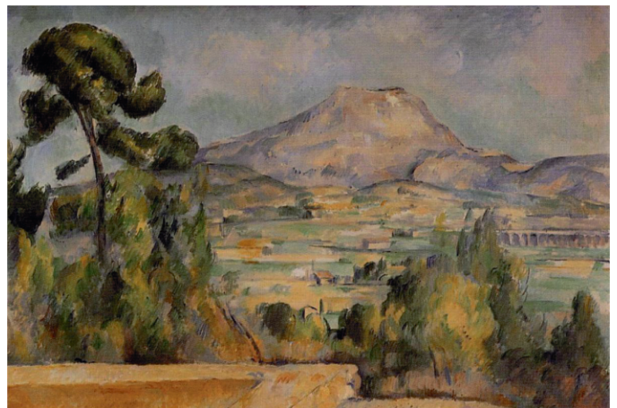
Paul Cezanne, Mont Sainte Victoire , 1890.