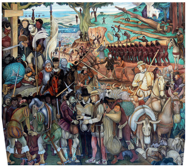
Rivera, Exploitation of Mexico by Spanish Conquistadors , 1929-45. National Palace, Mexico City