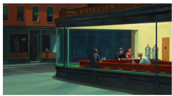
Edward Hopper, Nighthawks , 1942. Oil on canvas, 33 x 60", Art Institute of Chicago.