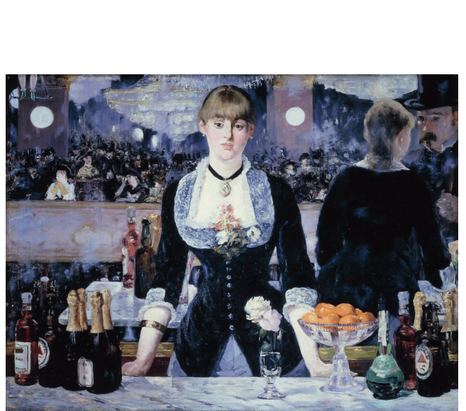
Edouard Manet, A Bar at the Folies-Bergère , 1881-82. Oil on canvas, 96 x 130 cm, Courtauld Gallery, London.