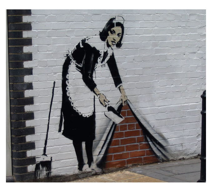
Banksy, Untitled (Maid).