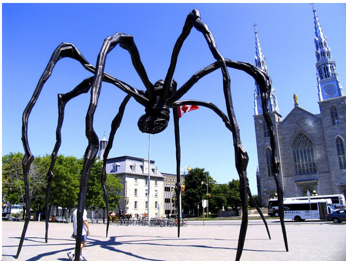
Louise Bourgeois, Maman , 1995 Bronze with marble eggs, 30 x 33', National Gallery of Art, Ottawa