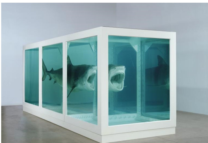
Damien Hirst, The Physical Impossibility of Death in the Mind of Someone Living , 1991 Tiger shark, glass, steel, formalin, 84" x 204", private collection