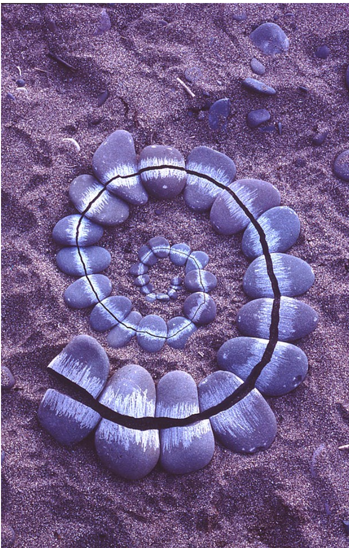
Andy Goldsworthy, Carefully Broken Pebbles Scratched White with Another Stone , 1985