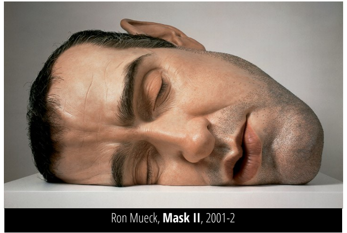
Ron Mueck, Mask II , 2001-2