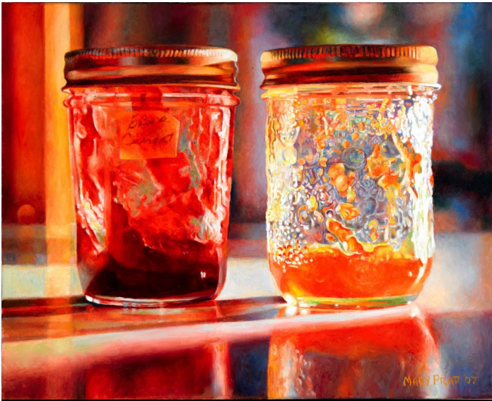
Pratt, Smears of Jam Lights of Jelly , 2007 Oil on canvas, 16" x 20"