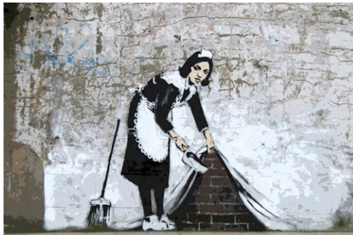
Banksy, Maid in London , 2007

Look online for close up colour versions of each artwork, a copy of the slide presentation, and links to other resources.