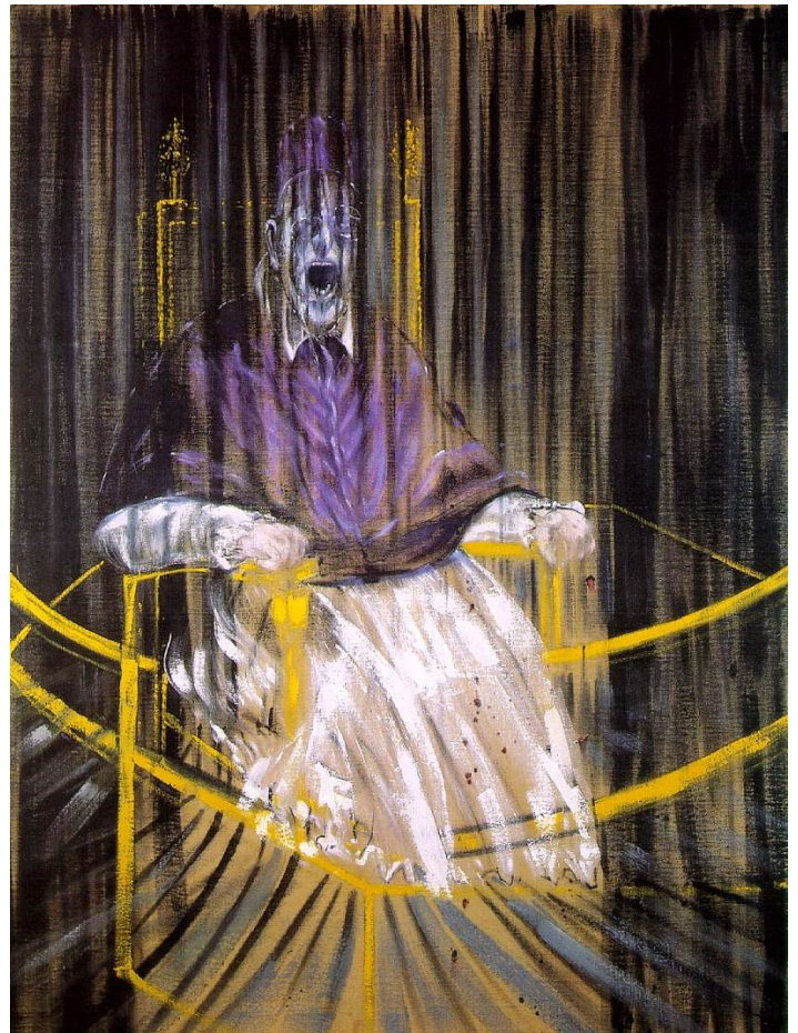
Francis Bacon, Study after Velázquez's Portrait of Pope Innocent X , 1953 Oil on canvas, 153 cm x 118 cm, Des Moines Art Center, Des Moines, Iowa