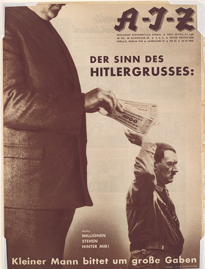
John Heartfield, Hitler Salute , 1932 Photomontage, cover of the Arbeiter Illustrierte Zeitung