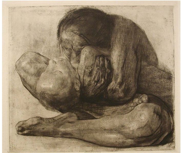
Käthe Kollwitz, Woman with Dead Child , 1903 Etching, 39 × 48 cm, Kunsthalle, Bremen