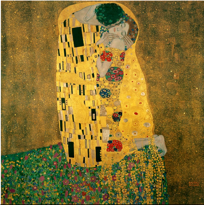
Gustav Klimt, The Kiss , 1907–1908