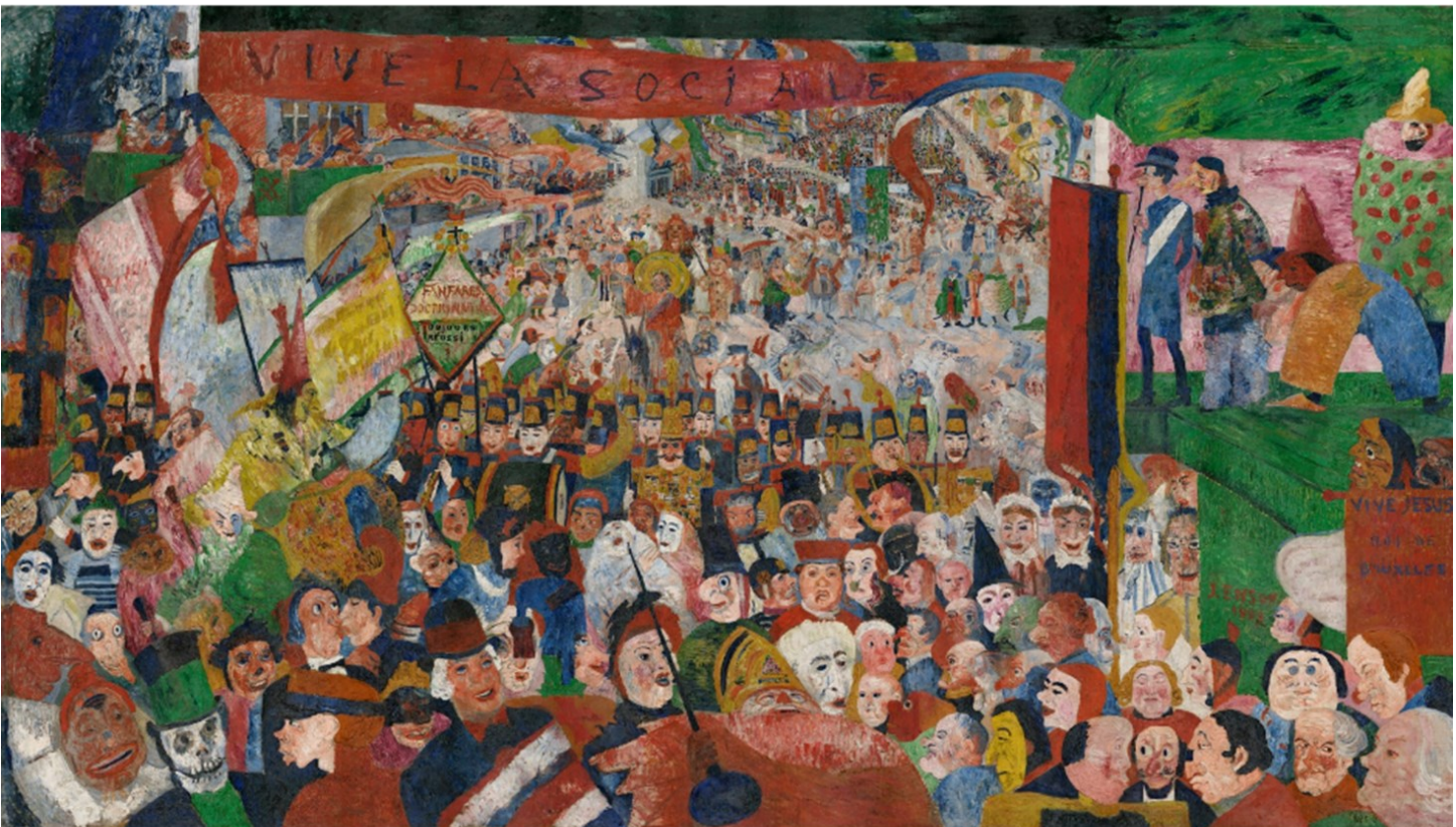
James Ensor, Christ's Entry into Brussels in 1889 , 1888 Oil on canvas, 252.7 x 430.5 cm, J. Paul Getty Museum