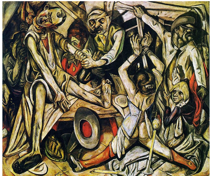
Max Beckmann, The Night (Die Nacht) , 1918-19 Oil on canvas, 133 x 153 cm, Kunstsammlung Nordrhein-Westfalen, Düsseldorf