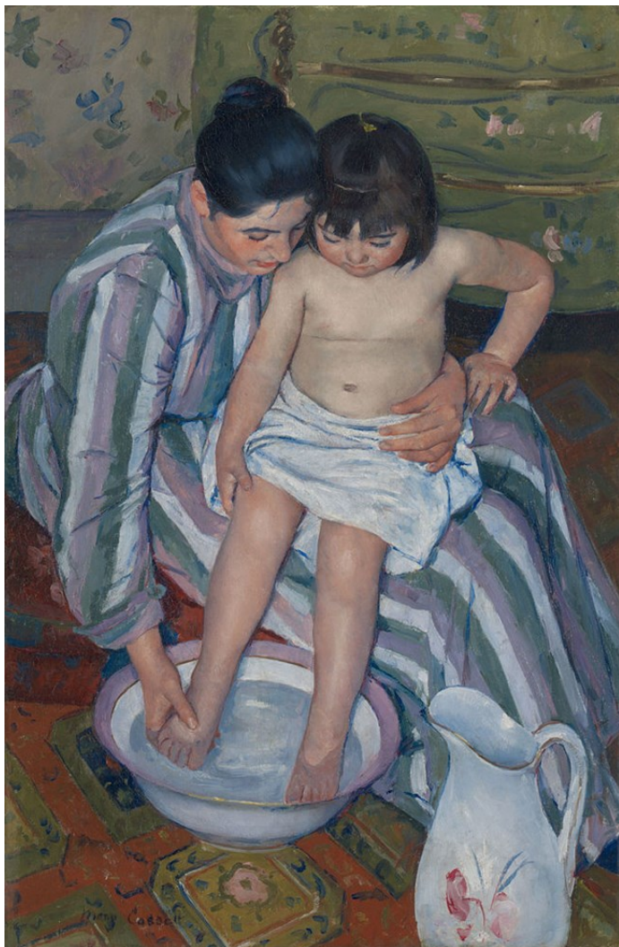
Mary Cassatt, The Child's Bath , 1893 Oil on canvas, 100 x 66 cm, Art Institute of Chicago