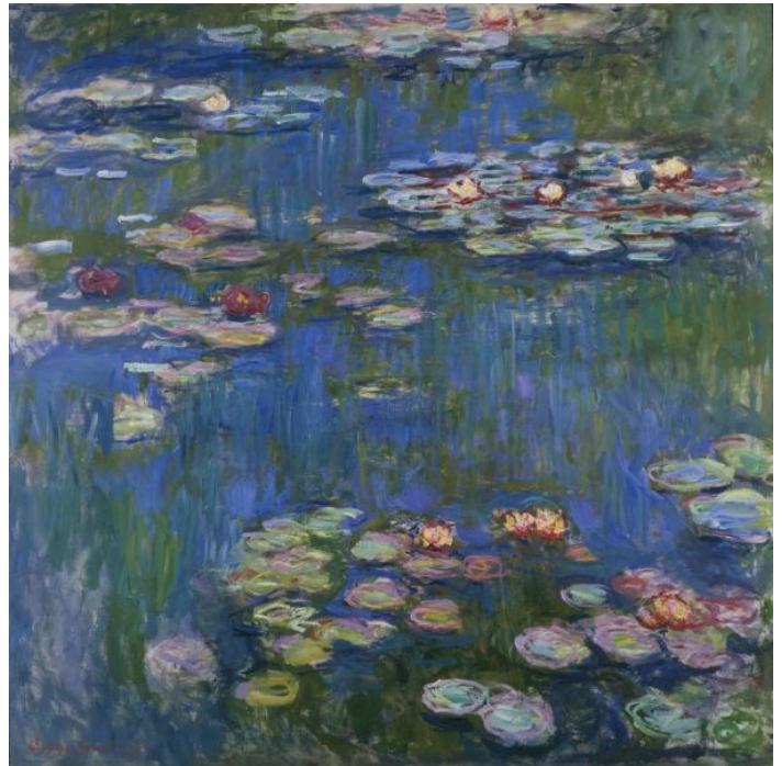
Claude Monet, Water Lilies , 1916 Oil on canvas, 200.5 × 201 cm, National Museum of Western Art, Tokyo