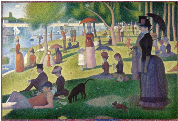
Seurat, A Sunday Afternoon on the Island of La Grande Jatte , 1884–1886 Oil on canvas, 207.6 cm × 308 cm, Art Institute of Chicago