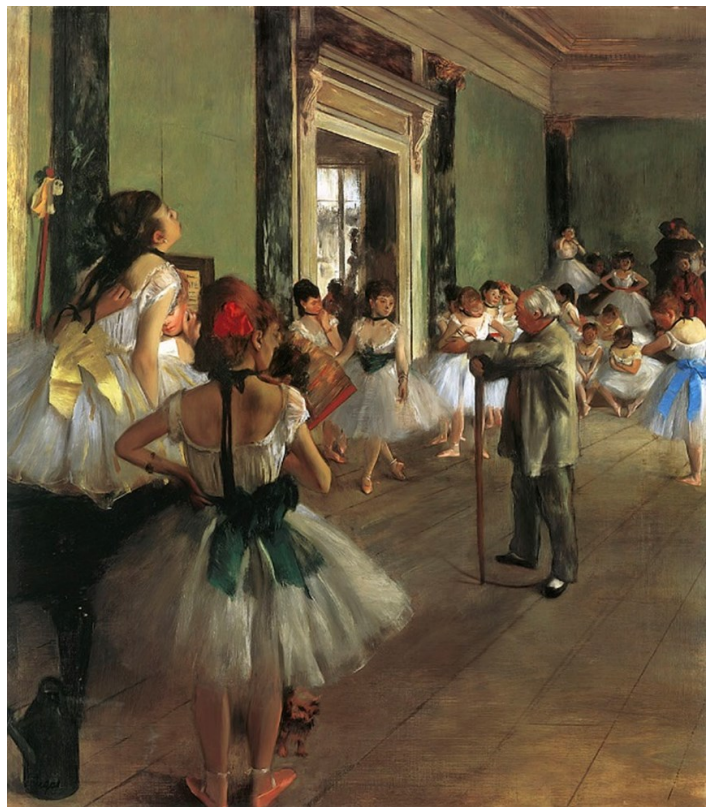
Edgar Degas, The Dancing Class , 1873–86 Oil on canvas, 85 x 75 cm, Musee D'Orsay, Paris

Look online for close up colour versions of each artwork, a copy of the slide presentation, and links to other resources.