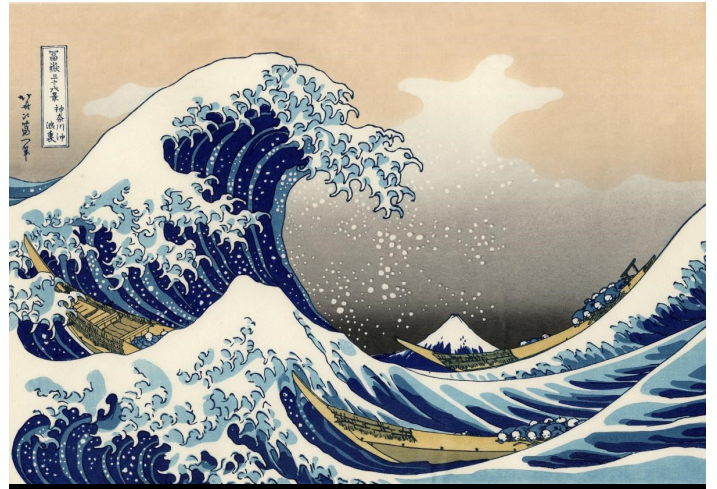
Katsushika Hokusai, The Great Wave off Kanagawa , c. 1829–32 Color woodcut, 25.7 cm × 37.8 cm