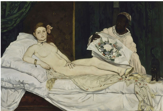
Édouard Manet, Olympia , 1863 Oil on canvas, 130.5 cm × 190 cm, Musée d'Orsay, Paris