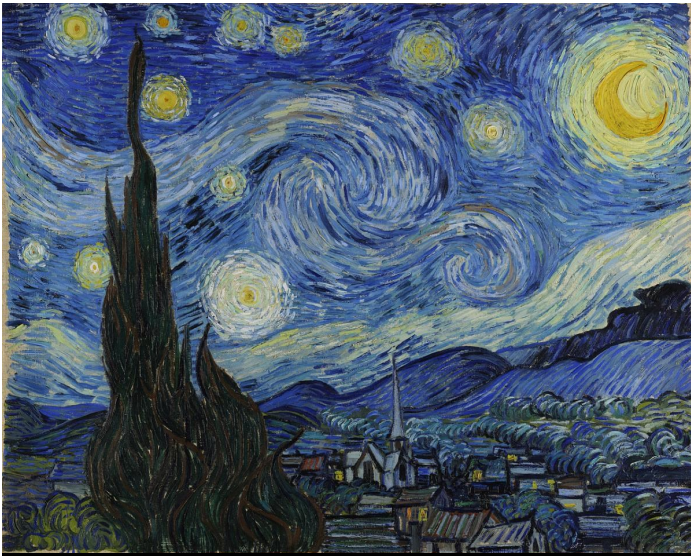
Vincent van Gogh, The Starry Night , 1889 Oil on canvas, 73.7 cm × 92.1 cm, Museum of Modern Art, New York