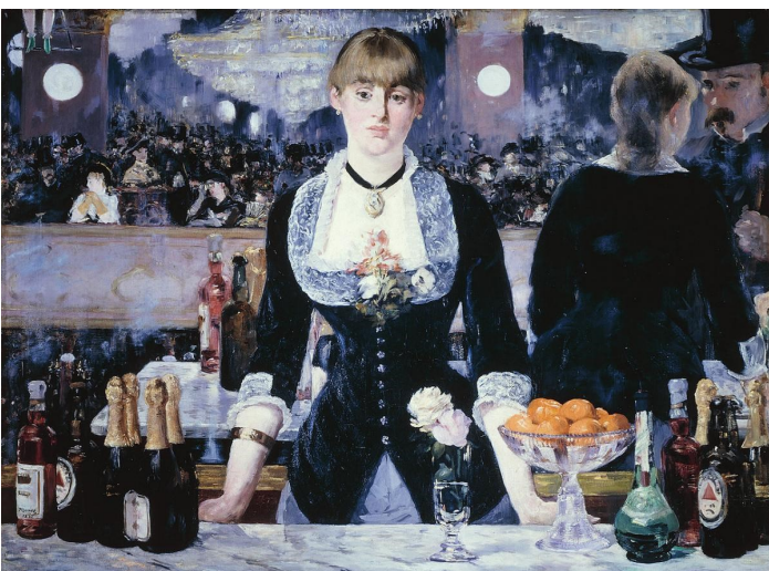
Edouard Manet, A Bar at the Folies-Bergère , 1881-82 Oil on canvas, 96 x 130 cm, Courtauld Gallery, London