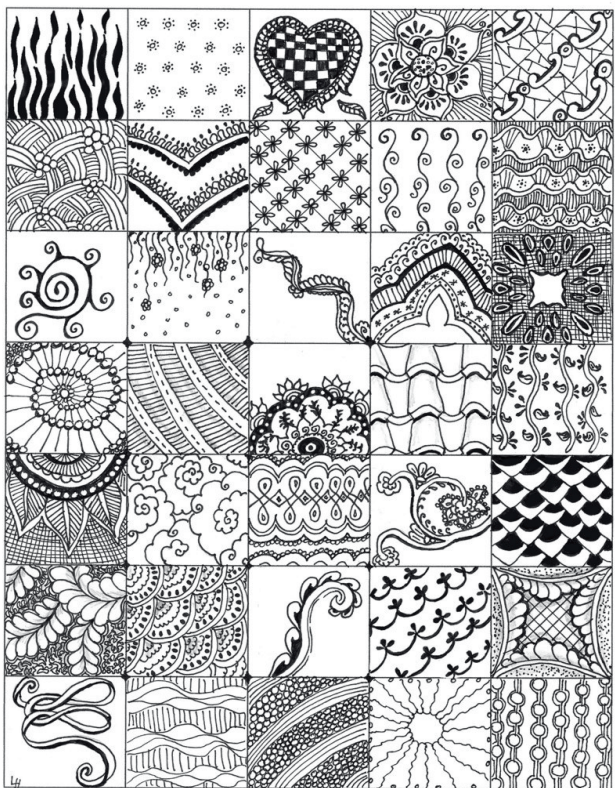
value scales using line