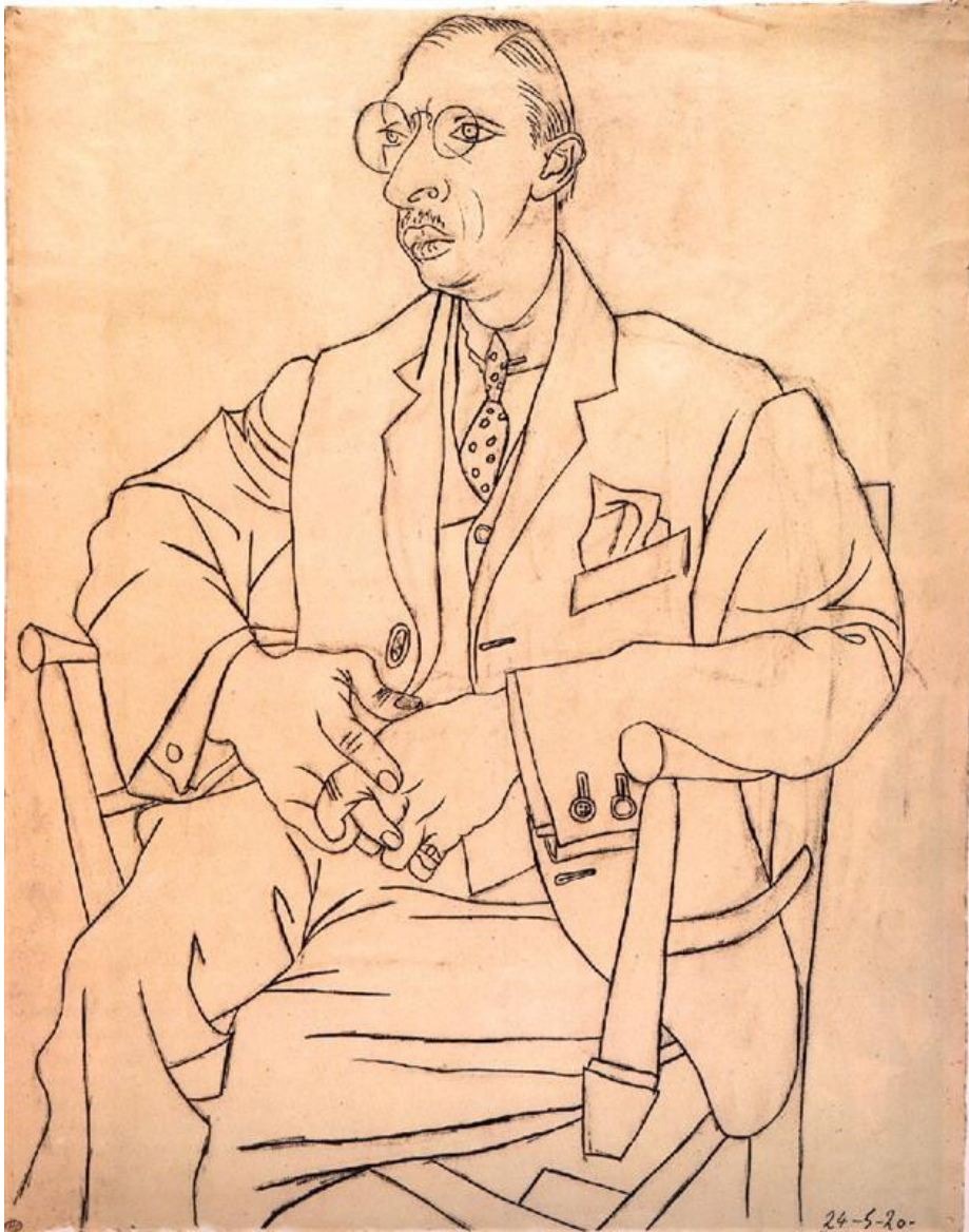
Pablo Picasso, Portrait of Igor Stravinsky , 1920 Drawing on paper, 62 x 48.5cm