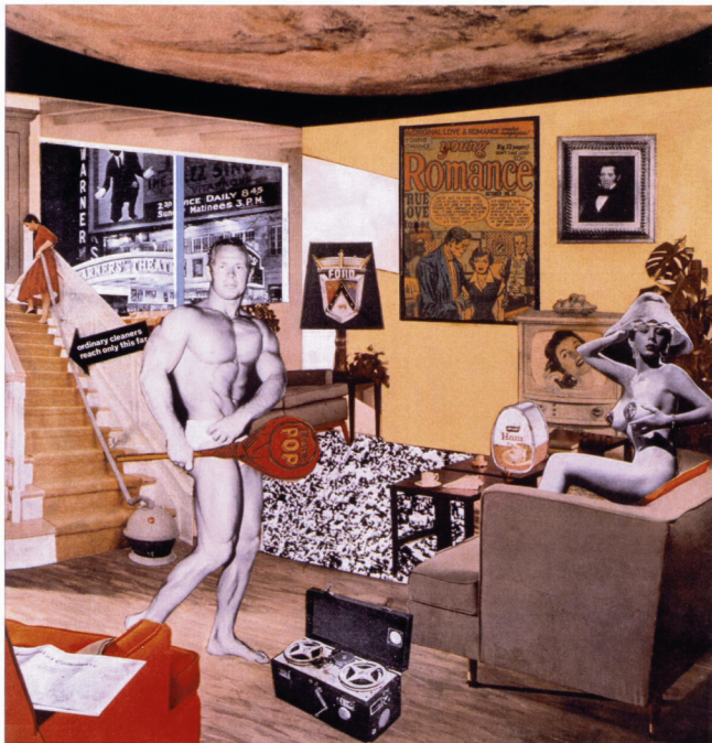
Richard Hamilton, Just What is it that Made Yesterday's Homes so Different, So Appealing? , 1956.