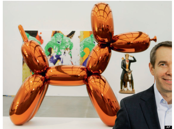
Jeff Koons, Balloon Dog (Orange) , 1994.