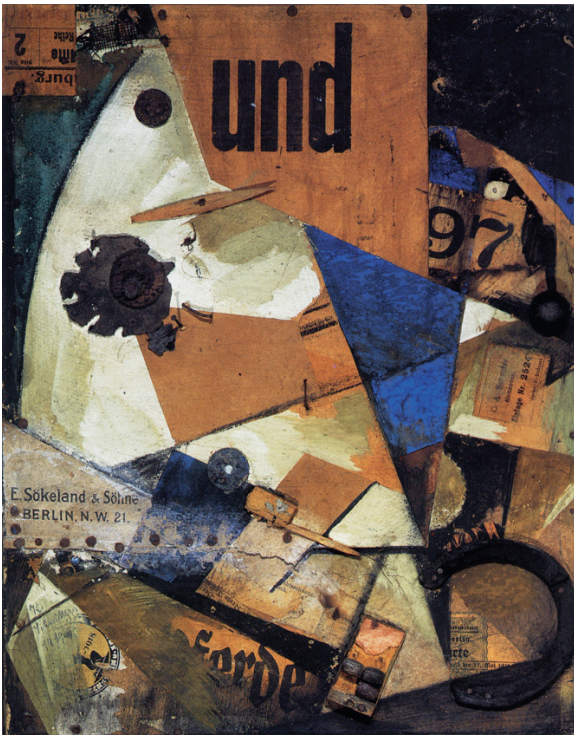
Kurt Schwitters, Das Unbild , 1919.