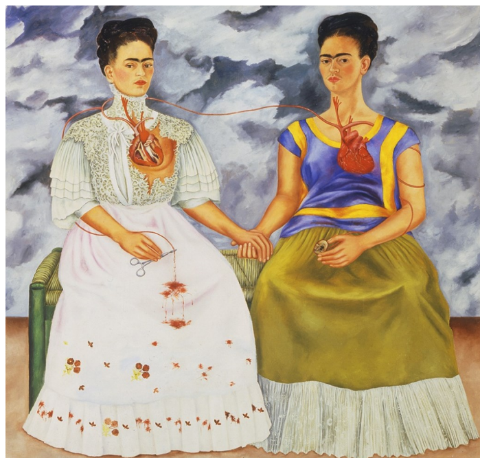
Frida Kahlo, The Two Fridas , 1939 Oil on canvas, 67" x 67", Museo de Arte Moderno, Mexico City

Look online for close up colour versions of each artwork, a copy of the slide presentation, and links to other resources.