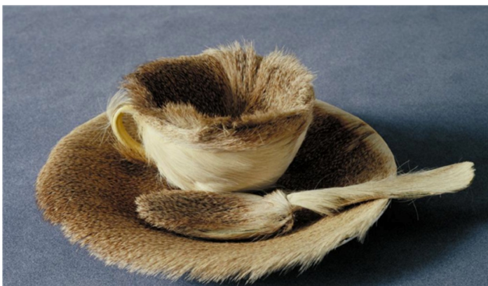
Meret Oppenheim, Object (Fur Cup) , 1936