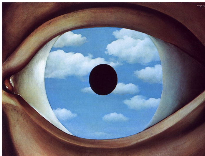
Rene Magritte, The False Mirror , 1928 Oil on canvas, 54 x 81 cm, Museum of Modern Art (MOMA), NY