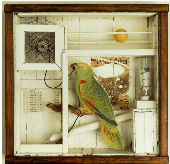
Joseph Cornell, Hotel Eden